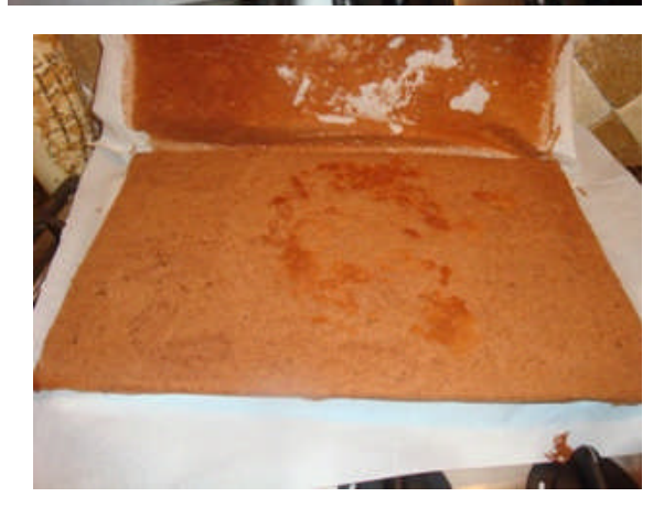
Step 11 -Roll the cake

Roll the cake up in the towel or paper, starting with a short side. Then let it cool on a wire rack. The cake portion is now done! If you need to take a break, put the cake in a sealed container or plastic bag.