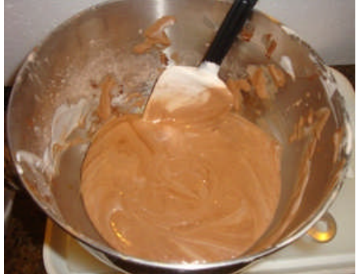
Step 8 - Gently spread the batter into the pan

Gently spread the batter evenly in the prepared pan.